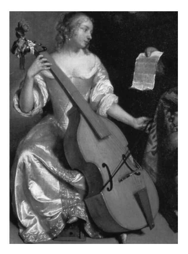
Relax & enjoy refreshments while listening to the music

Entrance Free; Cream Teas for sale; proceeds in aid of Church